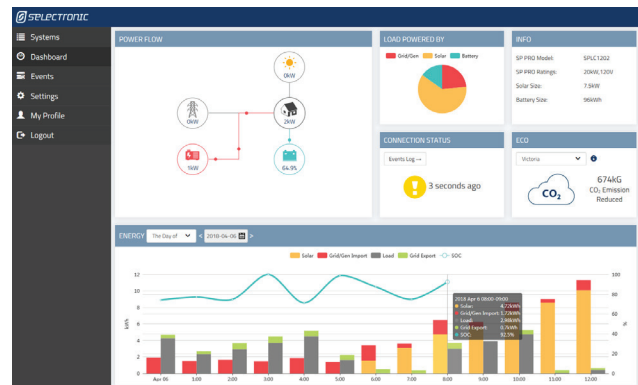
On-Grid System With Generator